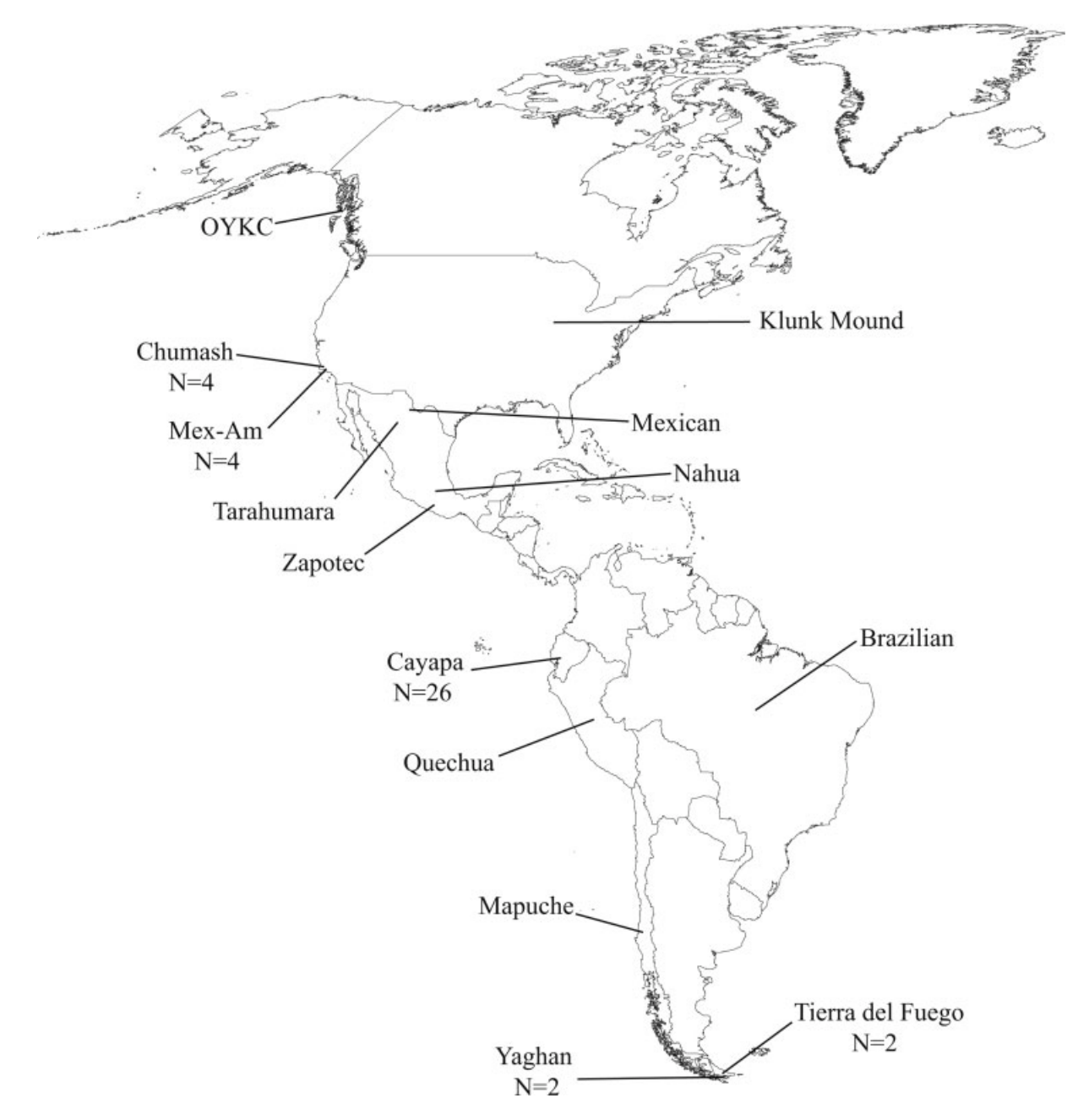
Fig. 1. Map of the Americas that indicates the approximate locations of the On Your Knees Cave individual and related samples. Sample size (N) of one at each location unless otherwise noted.

et al., 2002a), is known to belong to the subhaplogroup of haplogroup D containing the OYKC haplotype. This individual's mtDNA exhibits mutations at nps 16223(T) and 16342(C) and matches the CRS (Andrews et al., 1999) at np 16325 (Table 5), mutations common to all of the Native American haplotypes in the OYKC subhaplogroup.